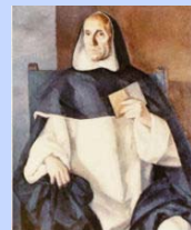
Francisco de Vitoria

As International Law continues to play a prominent role in the legal arena, access to an online collection to assist in researching the evolution of this important area of law is essential.