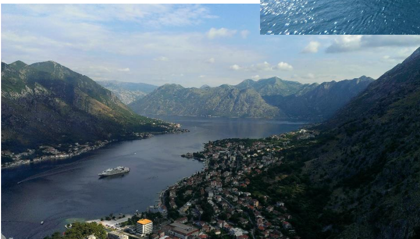
We always reached highest point of city for amazing views or