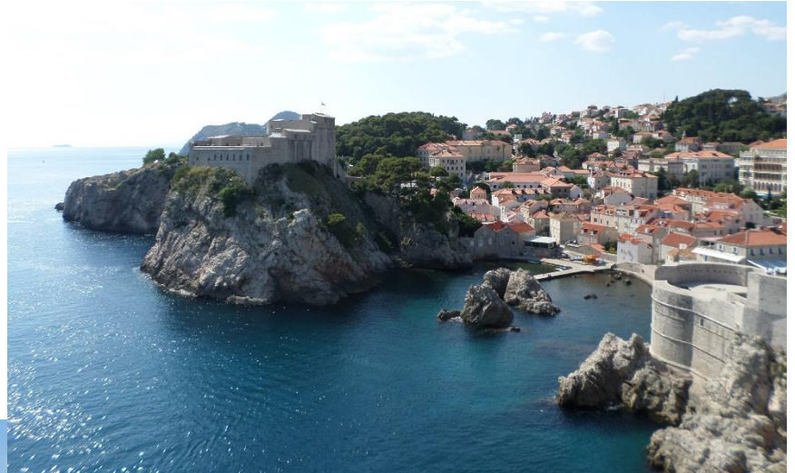
Dubrovnik in Croatia.