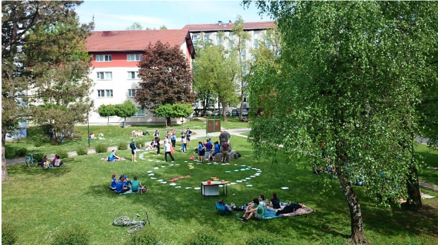
Part of territory of dormitories and students enjoying sunny day with different activities.

different places in city, many classmates living together, new friend from other faculties and countries.