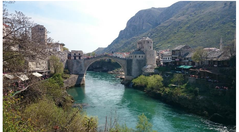
Visitig famous bridge in Mostar, Bosnia.