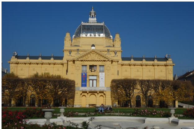
In Zagreb (Croatia)

QuickTime™ and a decompressor are needed to see this picture.