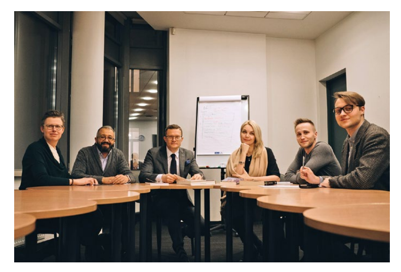
Working group on the development of the Law and Technology programme, 2018

Bilbao, where we met with University of Bilbao faculty members and visited the Basque country and the Guggenheim museum. We had a very fruitful faculty meeting and a strategy meeting, and discussed a lot of interesting projects and ideas for the school. So, I will always remember this trip, because it was not only important for the school and its international cooperation, but also rewarding as a cultural experience. And I will always remember the Christmas events that I have attended at RGSL. They have always been fun and unforgettable parties and events, and there have always been artists or musicians playing. I remember one that we had at the school premises, where the not-that-famous-back-then Latvian cello band Melo-M was playing; I think two years later I was attending their concert in a big concert hall packed with people, and I was thinking that, "Oh, just two years ago they were playing at our Christmas party and we were dancing a sirtaki."