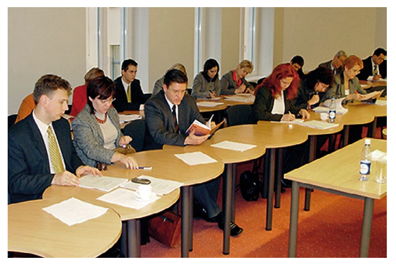
CLE training seminar for parliamentarians, 2003