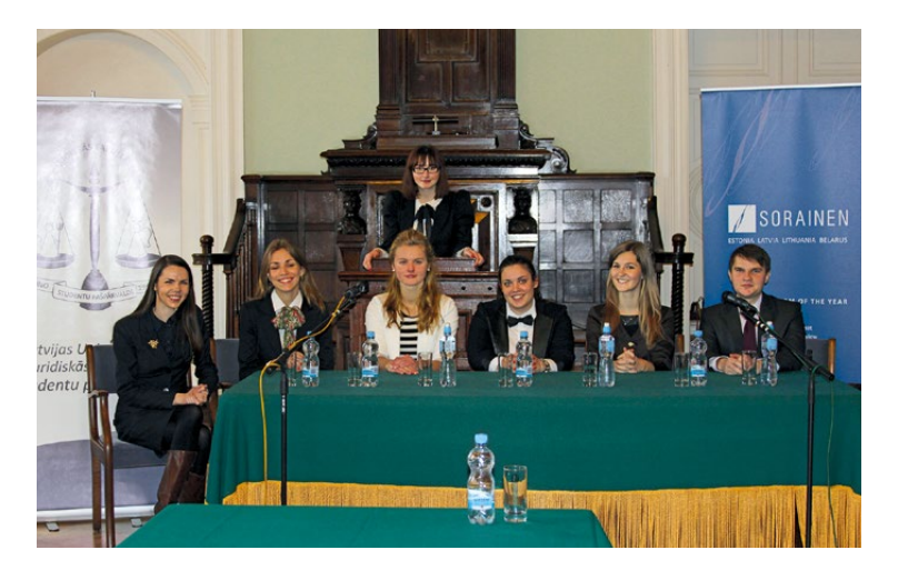
RGSL team at the Kārlis Dišlers Constitutional law moot court competition, 2011

I consider the two most prominent events during these 20 years of RGSL to be: 1) the promotion of values of human rights and democracy during Latvia's transitional period from socialism to a market economy and during the accession period of Latvia to the EU and NATO; and 2) the initiation of RGSL Bachelor programmes based on demands in the job market.