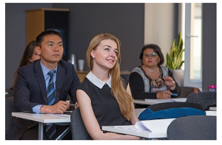
RGSL Intensive programme students, 2017