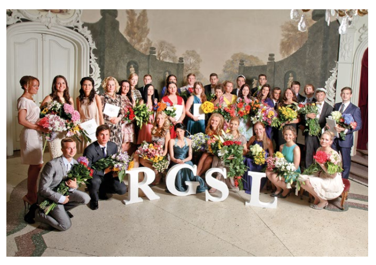
The first Bachelor programme graduation, 2013

I wish RGSL congratulations on its 20-year anniversary and all the best for the continuation of all the RGSL programmes, including the many new developments that have been or may be implemented.