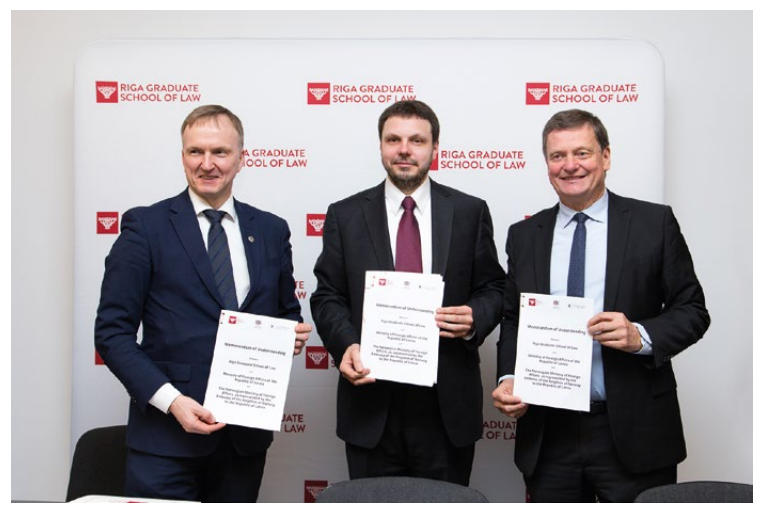
Signing of Memorandum with the Government of Norway, 2018