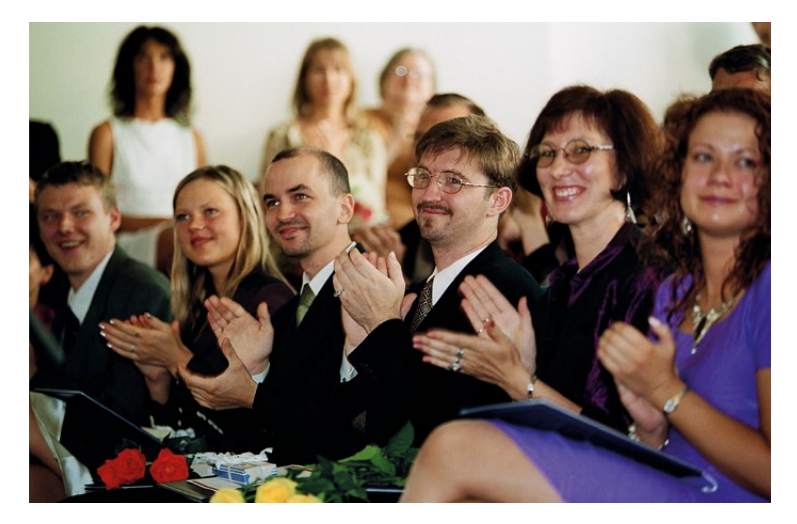
FEU/MEL programme students, 2002

After graduation and getting a diploma, I was required to apply my acquired knowledge about EU law in real life. Before my studies I was working at the Consular department of the Ministry