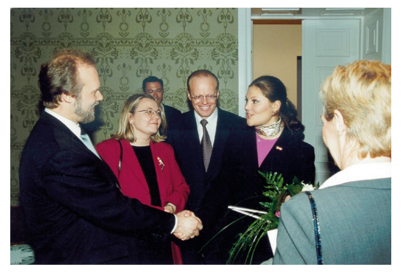
Opening of the Art Nouveau exhibition at Alberta 13 building, 2001