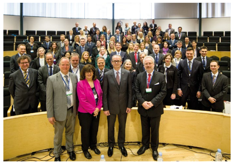
TRIO Presidency conference on the EU Charter of Fundamental Rights, 2015