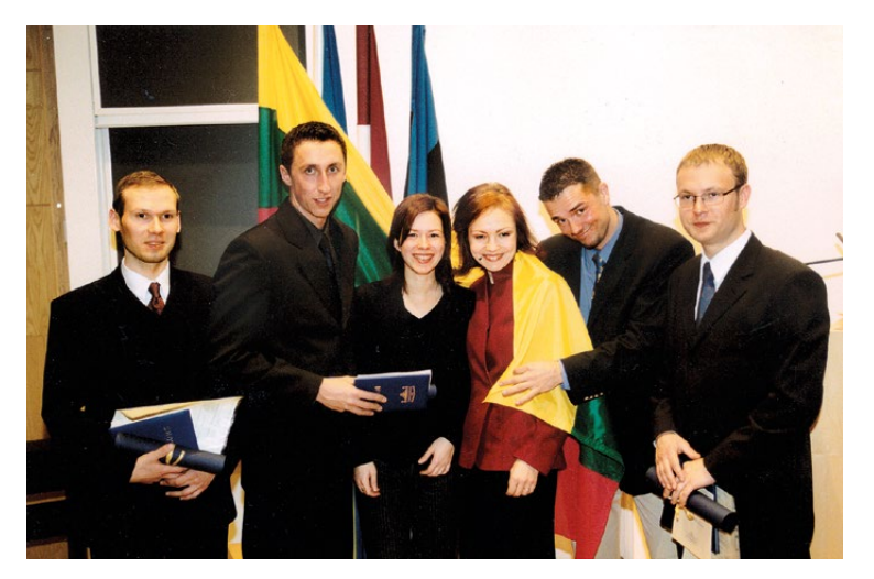
The first Lithuanian graduates, 2001

I have benefited enormously from these opportunities, and I hope they will be passed on to the next generations of students.