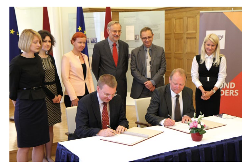
Signing of Agreement with the Ministry of Foreign Affairs on a training programme for representatives of the Eastern Partnership region and the Central Asian countries, 2014

The programme started with the countries of the Eastern Partnership, since we are neighbours: Belarus and Ukraine are really close to us. But we also lately have included the countries of