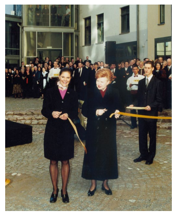
Ribbon-cutting at the RGSL Inauguration ceremony, 2001

So, in comparison, in twenty years the market has changed, and also the situation of competition has increased. It is also good for Riga Graduate School of Law to be always up to date in terms of quality.