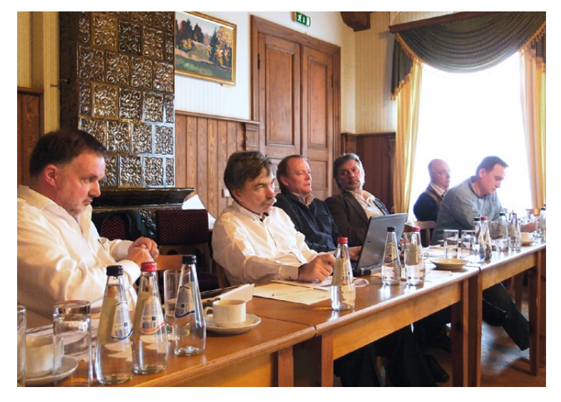
Brainstorming in Dikļi, 2012