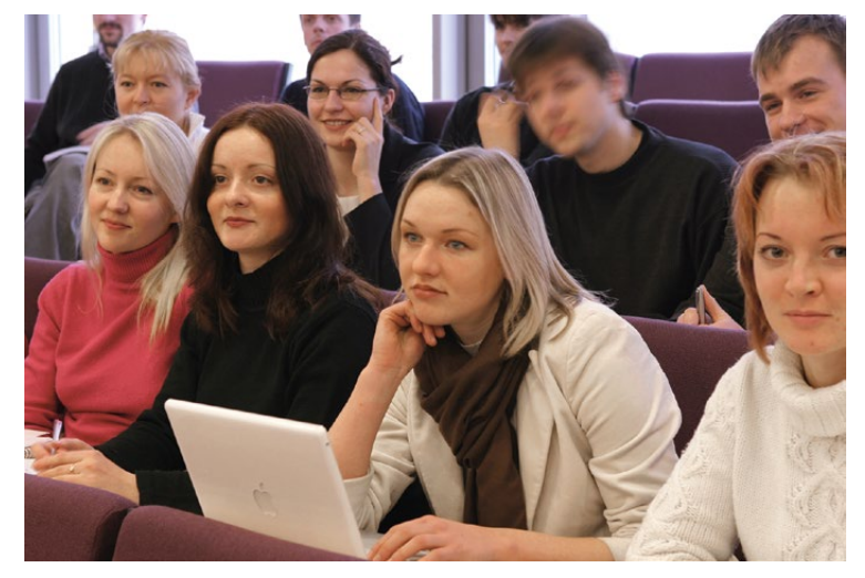
Students at a lecture, 2004