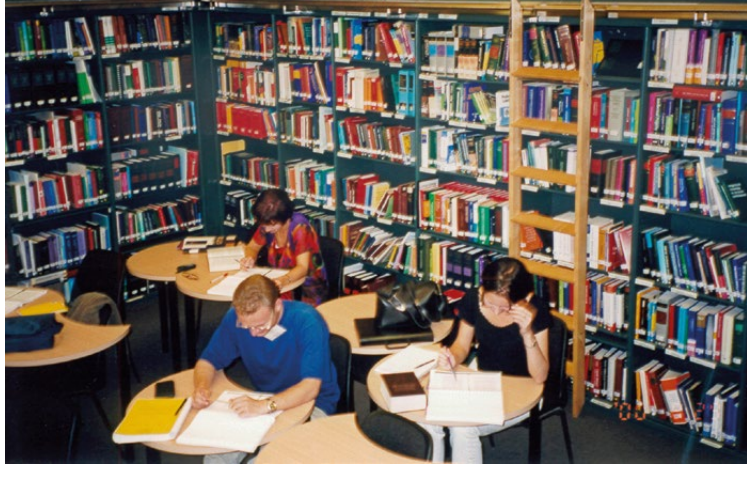
Students at the Library, 2000