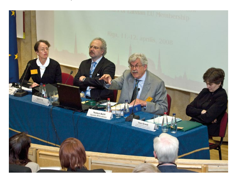
RGSL 10-year-anniversary conference "EU-learning: Democracy through Law", 2008

These processes in Latvia were not unique. It was a time when the liberal values that dominated during the transformation from socialism to democracy in the whole region of Central and Eastern Europe where being replaced by populism and anti-liberal values. Overall, trust in public institutions was low. Politicians were