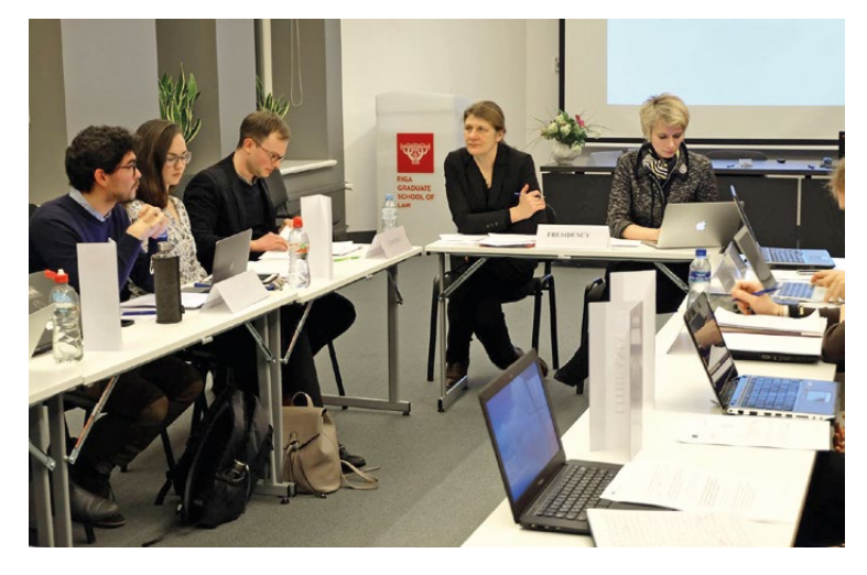
EU Summit simulation with Masters programme students, 2018

RGSL was established to support Latvia's accession to the EU. Having accomplished this mission, it can now become an Excellence Centre for expertise in EU integration, Human Rights and International Law. The visiting foreign faculty as well as the expertise from Latvia's EU integration set the necessary preconditions. An advanced programme for European neighbourhood countries and Central Asia is a great start in this direction.