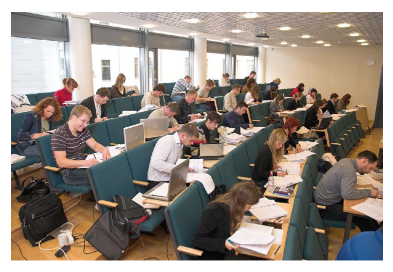
Master students taking an exam, 2006

At the same time with the new information society and information era that we are living in, there are different challenges that lie ahead for all of Europe, and we need to think of what could be the fields of law where RGSL could continue serving its role as a centre of excellence regionally. That involves thinking of new Masters programmes, thinking of new services for the legal community. Continuing legal professional education and providing support to already practicing lawyers has become a very important