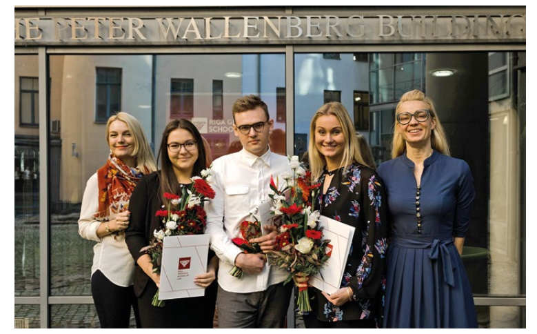
Student Excellence Award, 2017