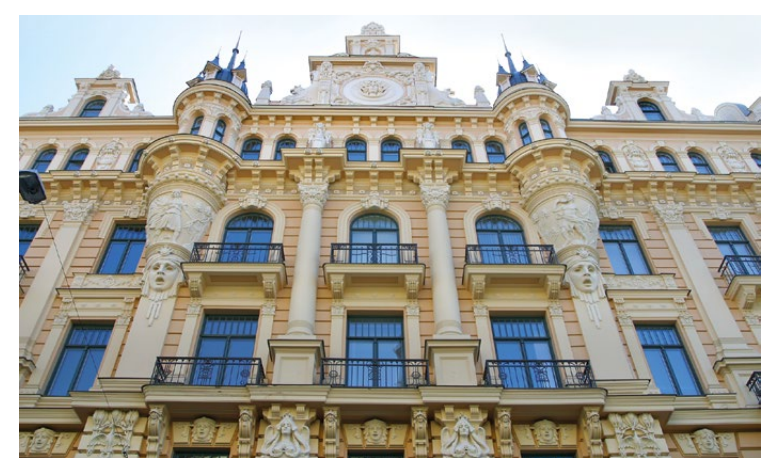
The building on Alberta 13, before and after the renovation.