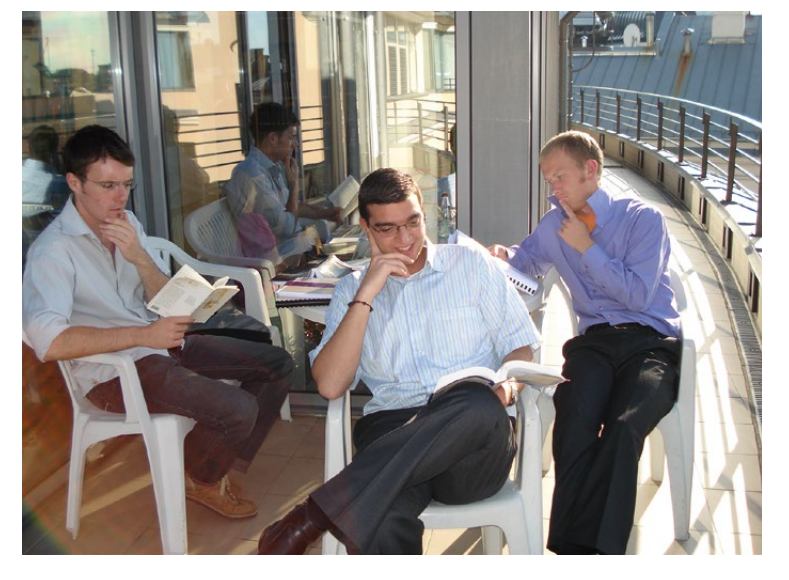
Students reading on the Library terrace, 2007