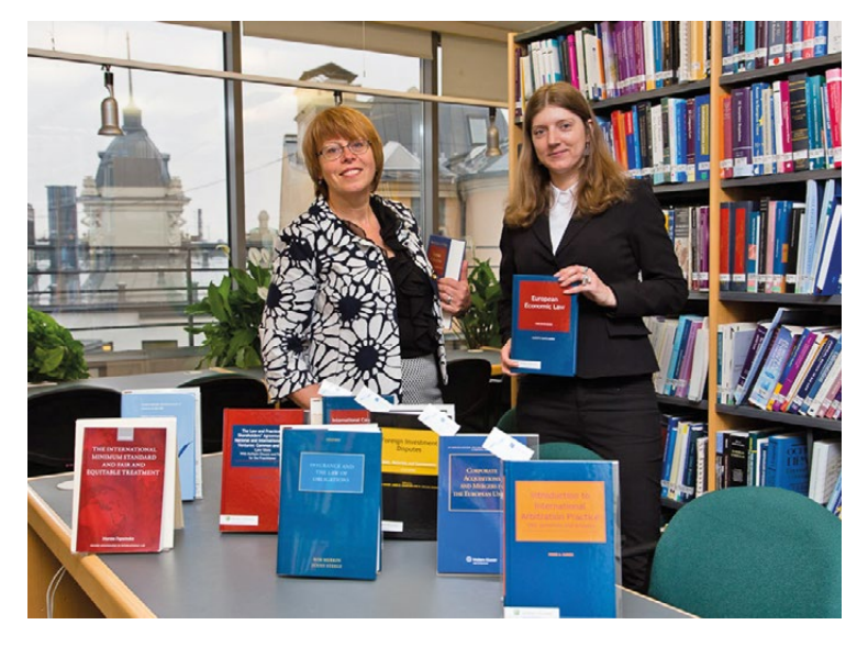
RGSL Library receives book donation from Sorainen law firm, 2015