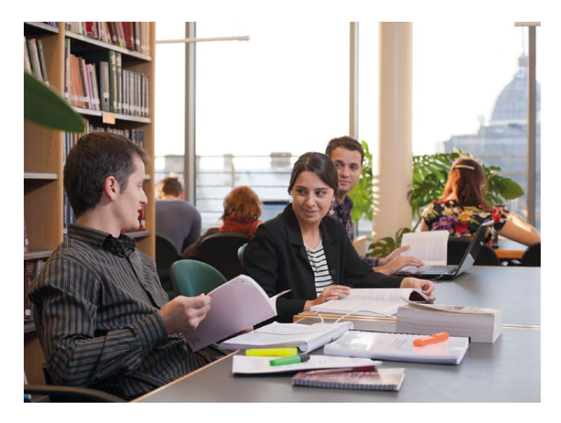
Students at the Library, 2011

In 2003 the RGSL Law Library, together with law librarians from Central and Eastern European universities and information centres, created the Consortium of Legal Resource Centers and Legal Information Specialists (Consortium), with the goal of promoting the formation and development of law libraries and information centres, acquisition of legal information resources, and proper dissemination and international cooperation among Central and Eastern European and other countries.