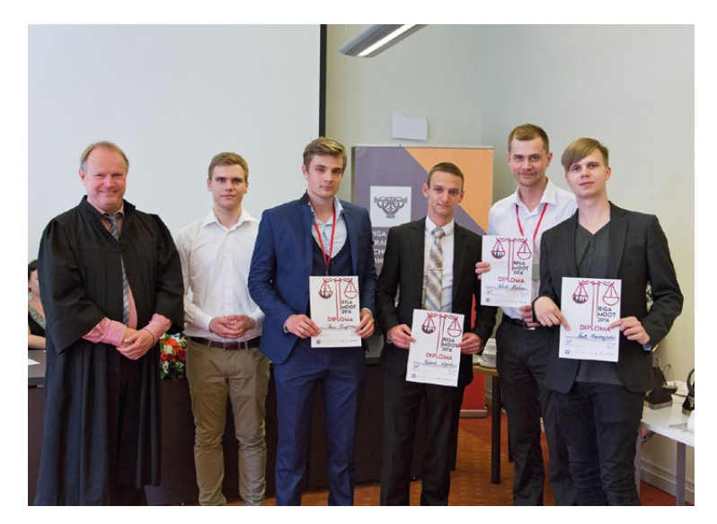
RGSL team at the RGSL moot court competition "Riga Moot", 2016

In my mind the keyword of the year 2015 is to preside. It means to be in authority. So was Latvia, so was RGSL, and so was I representing them both back then. Let us retain it in the following decades of RGSL and the coming centennials of the Republic of Latvia and its capital city, where the school is meant to thrive.